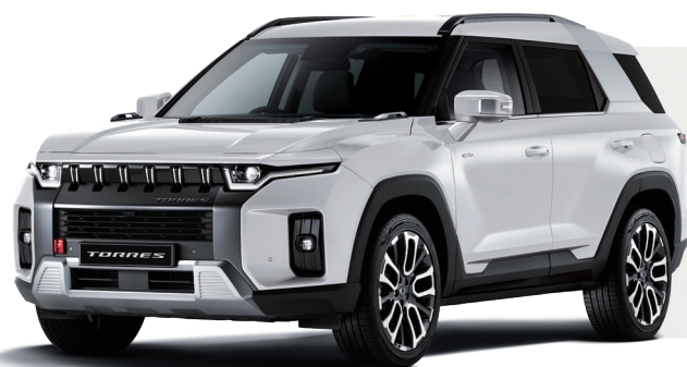
GRAND WHITE (WAA)