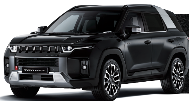
SPACE BLACK (LAK) (1-Tone Only)

2-TONE EXTERIOR PACK (BLACK ROOF) Black colour treatment on the C-pillar detail, styled roof rails and roof mounted air spoiler