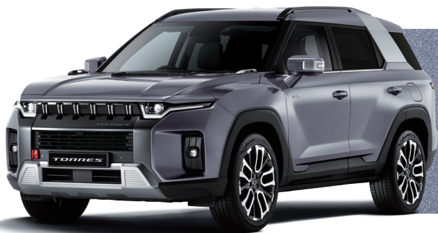
IRON METAL (ADE)

Driving the Torres says something about you. Your choice of colour says something more. There's a range of sophisticated colours to match your personality.