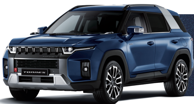
DANDY BLUE (BAS) (1-Tone Only)