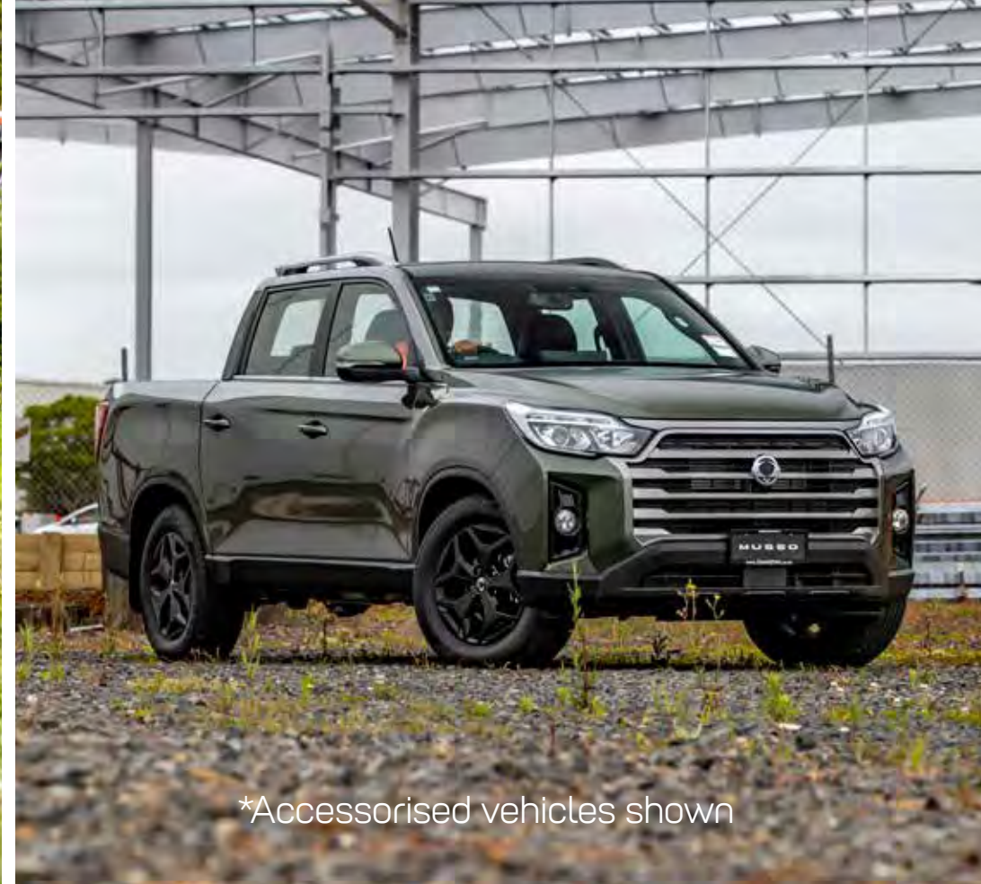
*Accessorised vehicles shown