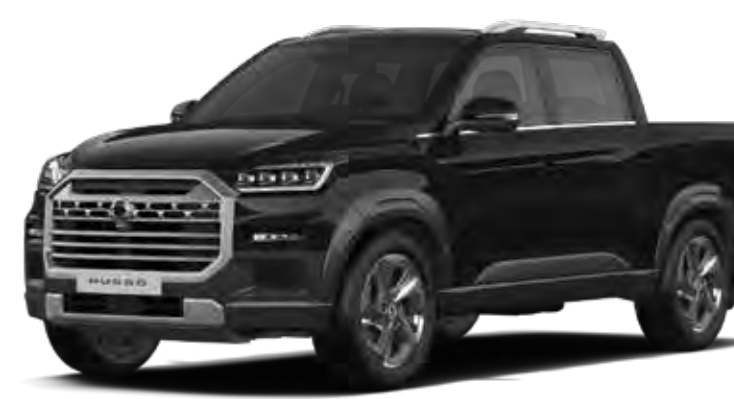
MUSSO GRAND ADVENTURE